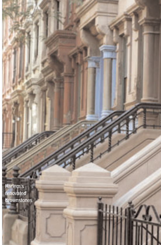
Harlem's renovated brownstones

H arlem is New York City's new chill spot, drawing Sarah Ferguson, Jennifer Lopez, Bill and Hillary Clinton, and Woody Allen to its revamped soul food restaurants and jazz and blues hangouts. Three years ago, President Clinton moved his office to 125th Street, starting the migration to uptown Manhattan; soaring real estate prices did the rest, prompting the area's rebirth. Style-savvy boutiques dot the area, and new luxury condos and renovated brownstones are being snapped up by the likes of Alfre Woodard, Marcia Gay Harden, and Maya Angelou . When you go, keep the car running, because this sprawling universe runs from 110th to 168th Streets, river to river.