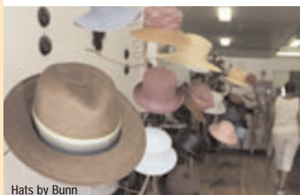
Hats by Bunn